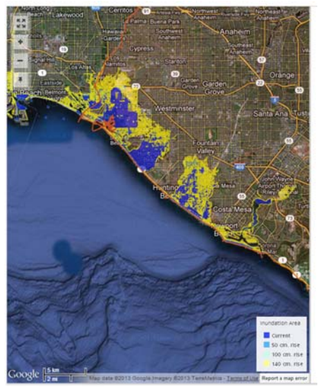
Figure 2 - Area at risk of inundation from 100-year flood event under current conditions (blue) and under 1400 mm sea level rise (yellow)

Figure 1 - Projections of global mean sea level rise based on selected climate projections.